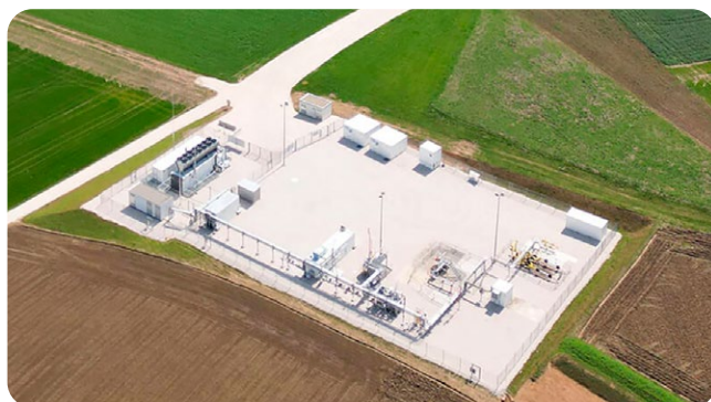
Underground Hydrogen Storage Demonstrator, RAG Austria AG, Rubensdorf

The project consortium, comprising of gas storage system operators, technology providers, utility, research- and governmental organisations, is supported by the Clean Hydrogen Partnership after successfully applying for the HORIZON-JTI-CLEANH2-2023-02-1 – Large-Scale Demonstration of Underground Hydrogen Storage funding programme. The project is scheduled to run until September 2029.